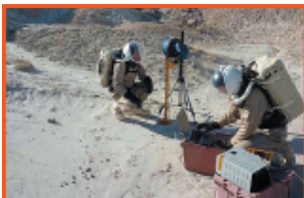
Figure 1. MUM operation in the field.