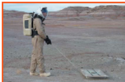
Figure 2. Collection of GPR data in the field during a simulated EVA operation.