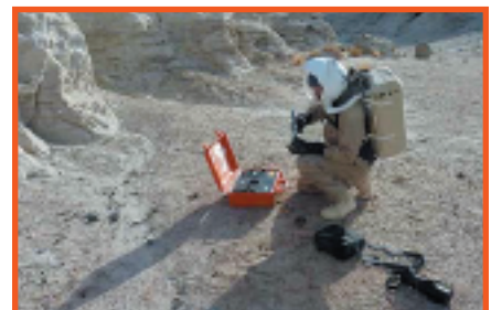
Figure 3. Terra XRD instrument operated in the field during a simulated EVA operation.