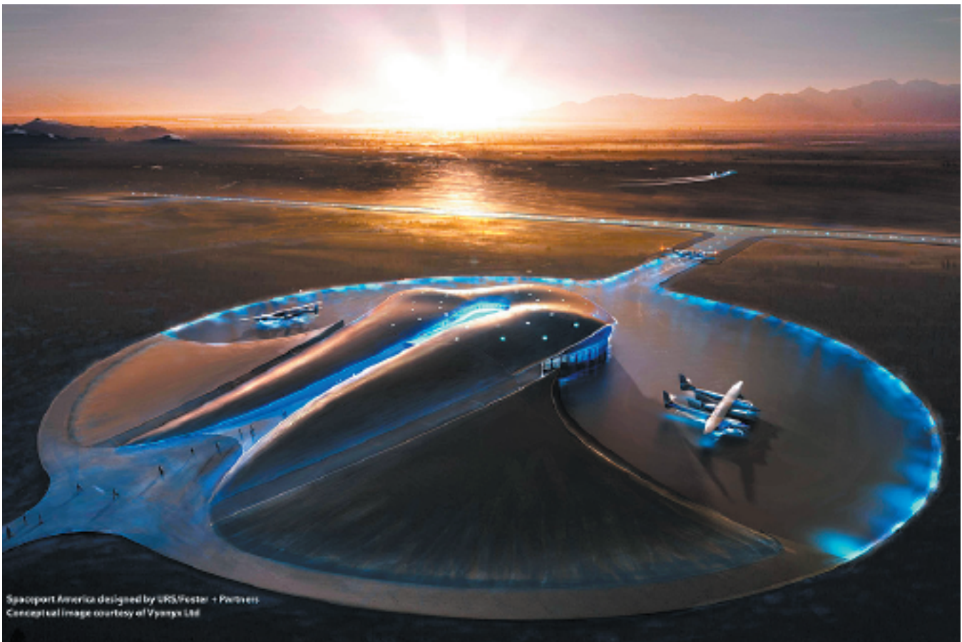
Spaceport America designed by GRS/Foster + Partners.